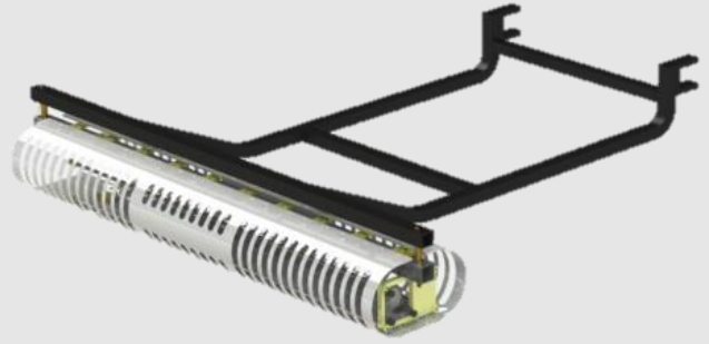
Airborne Cell with R44 Mount